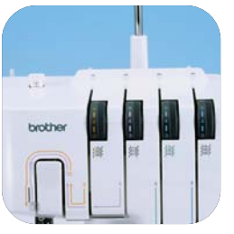
4 colour easy threading guide